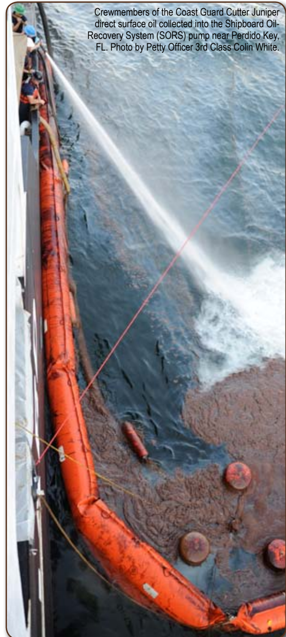
Crewmembers of the Coast Guard Cutter Juniper direct surface oil collected into the Shipboard Oil-Recovery System (SORS) pump near Perdido Key, FL.

Building on a May 19th White House briefing, the Symposium provided an opportunity for the federal agencies to update the research community on their response to date as well as their research priorities. The primary focus of the meeting was to provide a forum for the external research community to identify for the federal agencies existing gaps in scientific knowledge surrounding