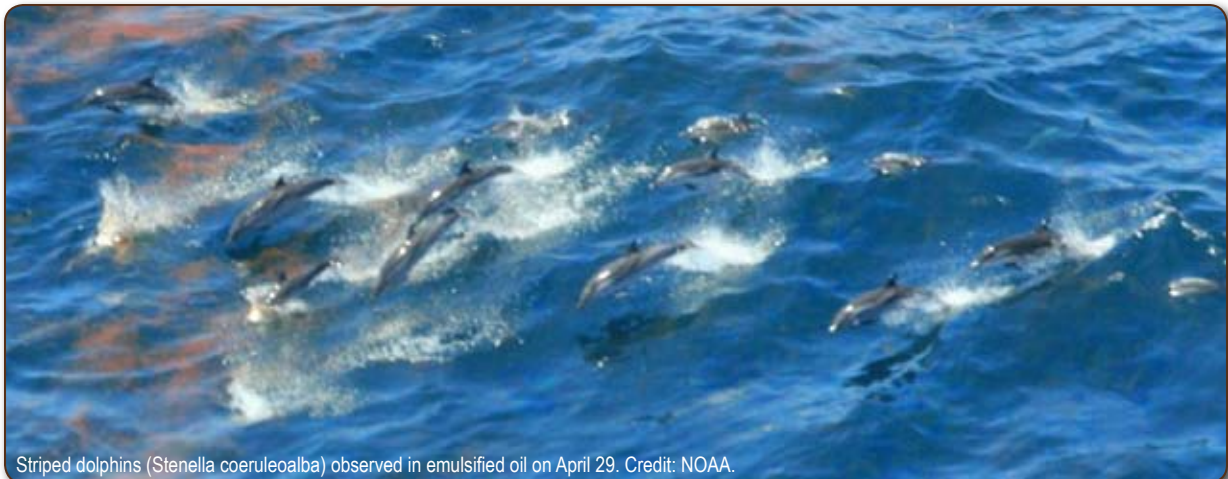
Striped dolphins ( Stenella coeruleoalba ) observed in emulsified oil on April 29.