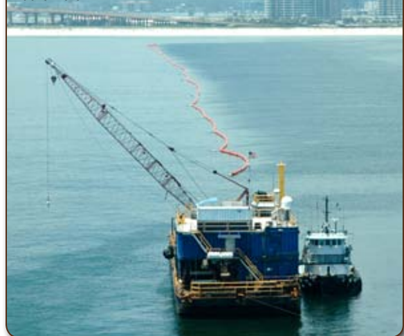
An effort to prevent oil from making its way to Perdido Beach, Ala., June 13, 2010.

The breakout group also noted that future grants and cooperative agreements ought to require a written plan for long-term data management that adheres to a standard protocol. Both the magnitude and fate and tracking breakout groups agreed that it is imperative to create a central database for