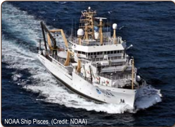
NOAA Ship Pisces.

including mobilizing the University-National Oceanographic Laboratory System (UNOLS) ships to use sonar to remotely sense oil in the water column, followed by gliders equipped with fluorometers to map subsurface oil. She explained that the group also suggested the use of autonomous underwater vehicles (AUVs) and gliders to collect water samples to quantify concentrations of dispersed oil as well as identify microbes to ascertain impacts on respiration. There was extensive discussion of a wide range of space-based assets, including ocean color and airborne observations, infrared, and other approaches as having been absolutely key to helping map the conditions in the Gulf before and since the Deepwater Horizon incident. McNutt concluded by highlighting the importance of a wide range of medium- to high-resolution remote sensing technologies, including both civilian and classified sources, for continuing to characterize the areas that may be affected by the incident.