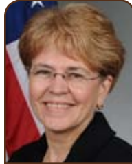
Dr. Jane Lubchenco Administrator NOAA