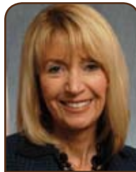
Dr. Marcia McNutt Director USGS