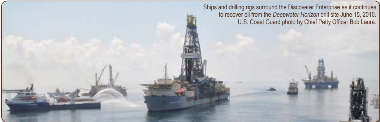
Ships and drilling rigs surround the Discoverer Enterprise as it continues to recover oil from the Deepwater Horizon drill site June 15, 2010.

must be repeated to establish the evolution of the distributions.